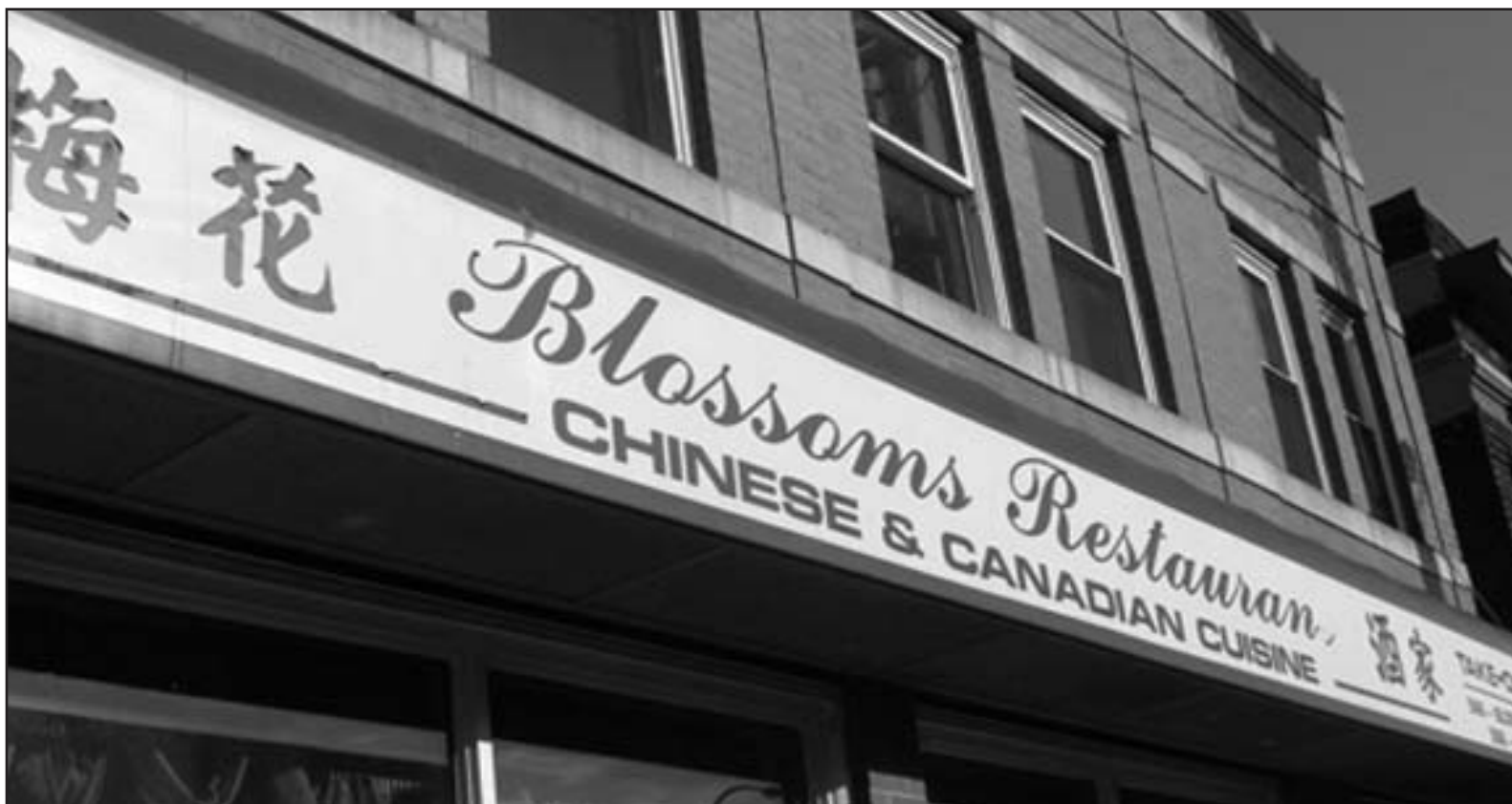
Blossoms Restaurant on Queen Street had water damage caused by pipes bursting.

When it is cold outside and there is wind, the wind creates a