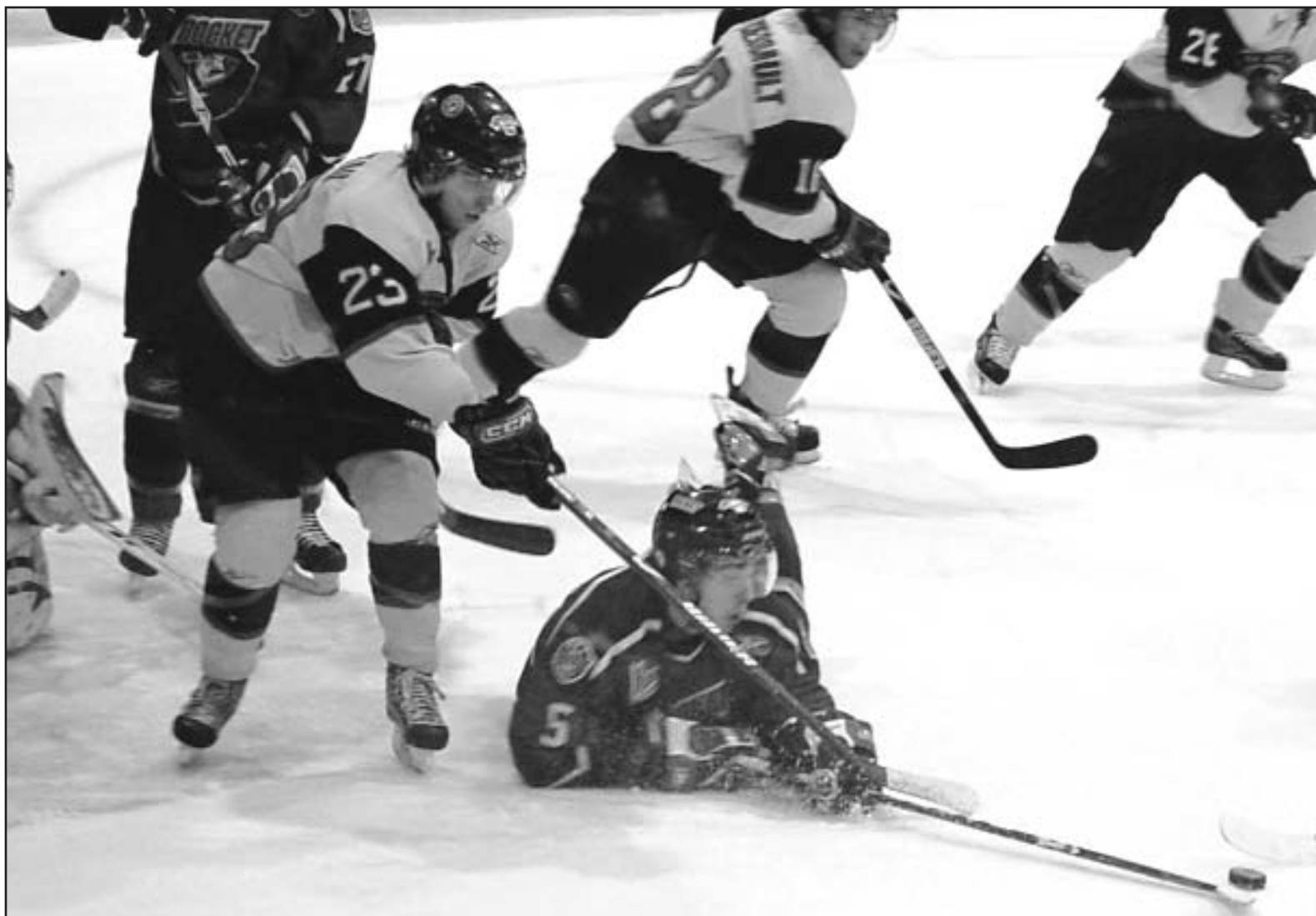
Players scramble to get the puck at the hockey game on Feb. 21 at the Civic Centre in Charlottetown.

The Rocket score again about 12 minutes in, on a powerplay, making the score 3-2 for the