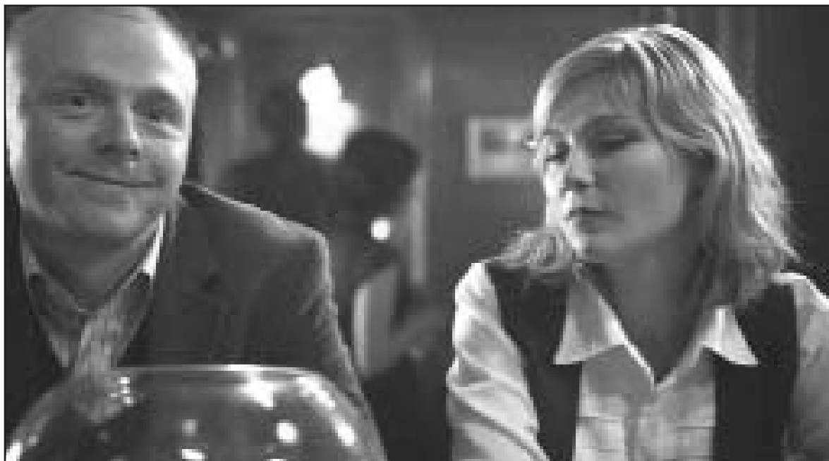
Simon Pegg and Kirsten Dunst star in How To Lose Friends and Alienate People, released on DVD on Feb. 17.

Pegg's characters are always lovable. They're always a bit clumsy and awkwardly charming. And good for him for breaking into American film, even if it wasn't a great one. But he brings that weird, nerdy, English charm to all his projects, making him a pleasure to watch on-screen, even in this piece of cinematic garbage.