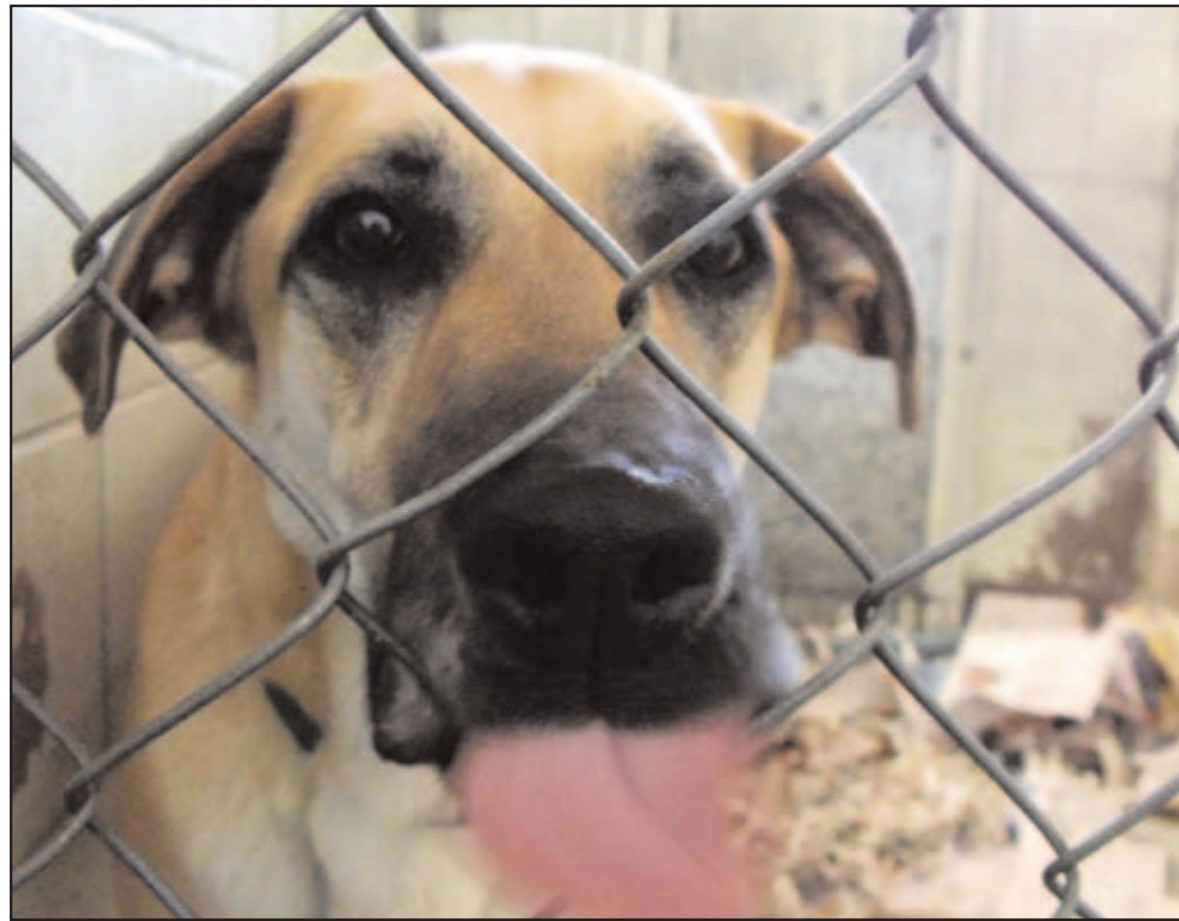
The P.E.I. Humane Society in Charlottetown has many animals available for adoption.

The economic crisis isn't affecting P.E.I. pet owners too dramatically – yet, says an Island animal shelter employee.